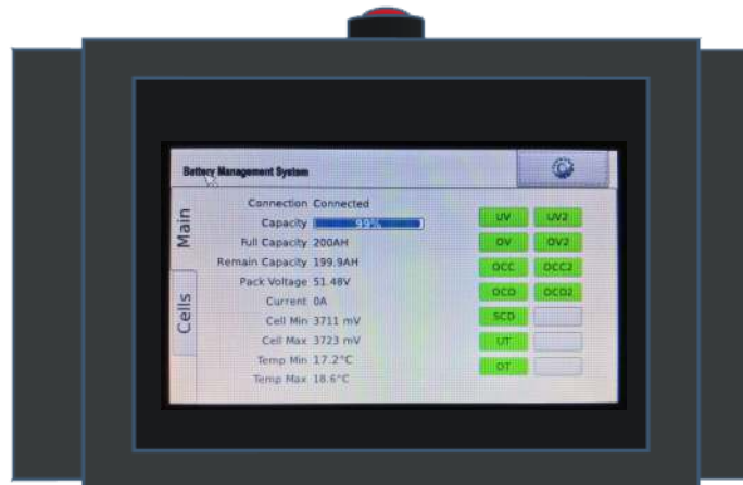
Touch Screen Display